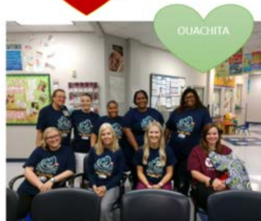
Region 8 Collage including Franklin Parish Health Unit, Ouachita Parish Health Unit and ROSE